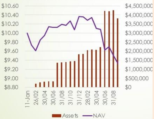
Assets & Net Asset Value Per Unit